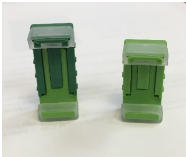
Figure 1: Large and Medium sizes

Thank you for using new Uni-Vers-All! For other great imaging products please visit us at www.flowdental.com