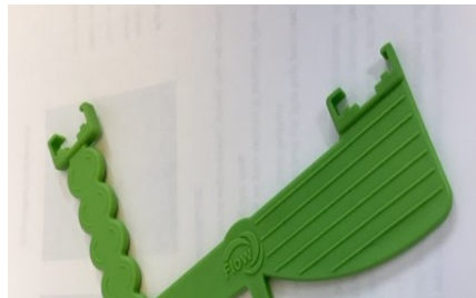
Figure 2: Anterior (a) and Posterior/Bite Wing Holders (b)